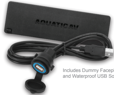
Includes Dummy Faceplate/Dust Cover and Waterproof USB Socket.