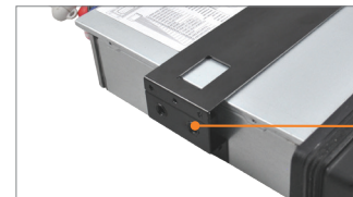
Uses existing Harley-Davidson® mounting location, screws and screw holes.