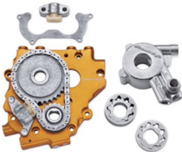
E. SCREAMIN' EAGLE HYDRAULIC CAM CHAIN TENSIONER AND HIGH-FLOW OIL PUMP UPGRADE KIT