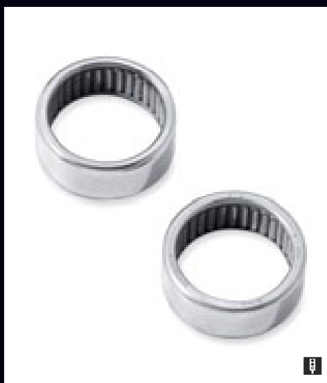
G. SCREAMIN' EAGLE HIGH-PERFORMANCE INNER CAM BEARINGS